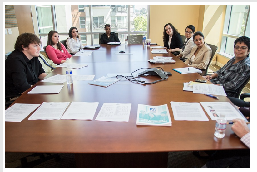
The CLI-TJSL Students Meet for the First Time