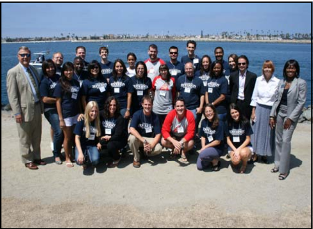
Volunteers from the Fall 2009 Orientation

If we learn anything in law school it's the importance of precedent, the undeniable influence of tradition, the solid strength of stare decisis, the of interplay history and context, how our current situation has been, can be, and will be defined by the things that have come before it.