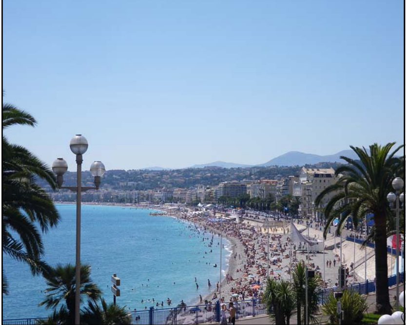
Cote de Azul, Nice, France