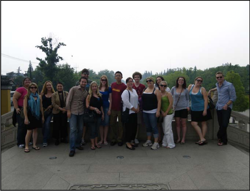
China Program: Thomas Jefferson Students