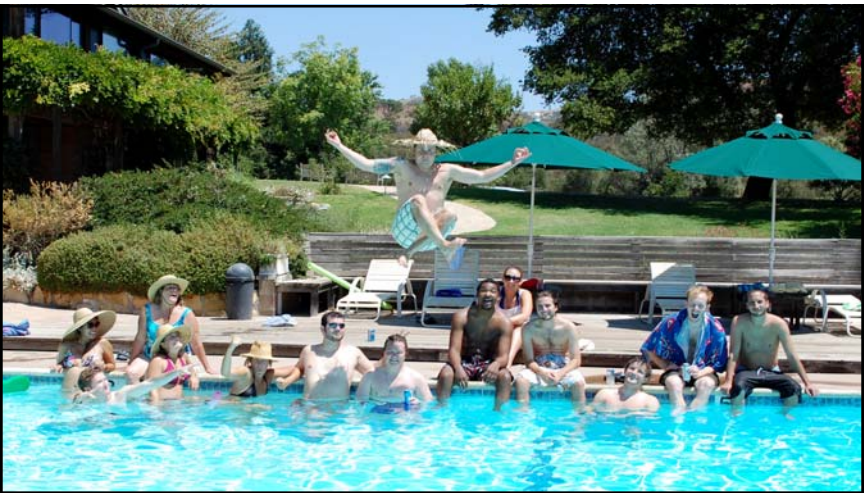
Below– The Splash! Commission of the New Year.

The Informer since my first semester in the Fall of 2007. It is these experiences that give me the confidence to say that; the group of students who have stepped forward to participate in the 2009-2010 Student Bar Association will strive, like never before, to set the precedent. They are an amazing collection of proud, hard-working people who will not cease to bolster your voices, protect your interests or stand up for your needs as students at Thomas Jefferson School of Law.