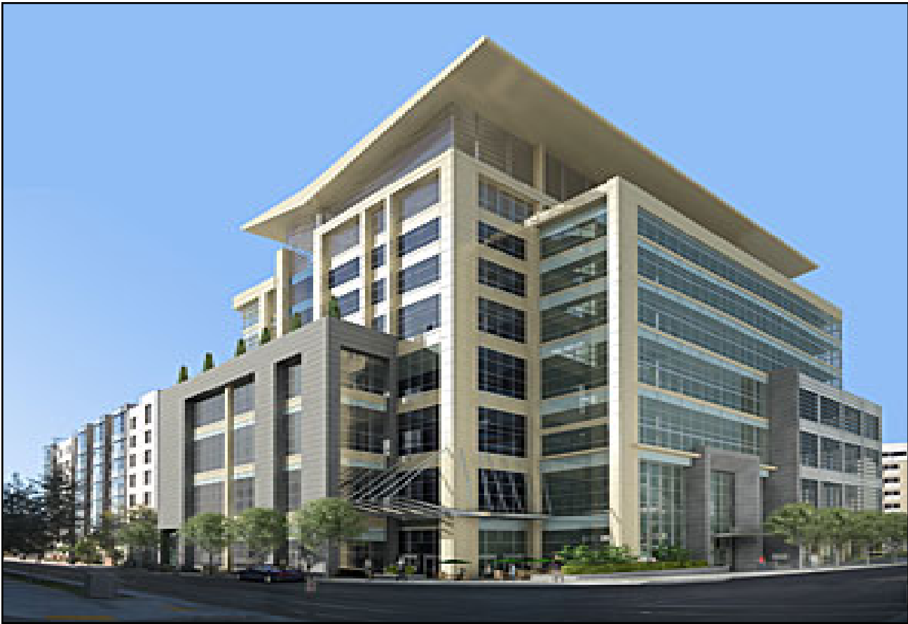
The New Thomas Jefferson Campus—Set to Open for the Spring 2011 Semester.

Early last fall construction began on the downtown site for Thomas Jefferson School of Law’s (TJSL) new campus. TJSL is now fully accredited and is an