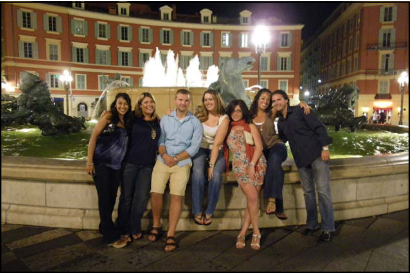
Nice, France Program: Thomas Jefferson School of Law Students

As an introduction to myself, I begin my second year of law school and look forward to being involved in the SBA and several clubs on campus. This summer was an amazing experience traveling to twenty different countries and twenty-nine different cities (a