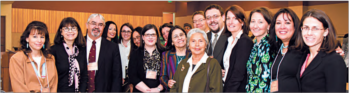
2011 Conference Organizers and Speakers for Gender Justice and Indian Sovereignty: Native American Women and the Law