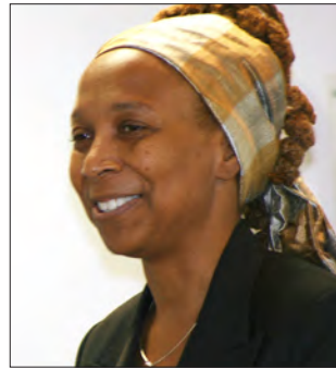
Professor Kimberlé Crenshaw

including the establishment of a clinic through which students and professors provide pro bono legal assistance to victims of domestic violence, in collaboration with the San Diego Family Justice Center.