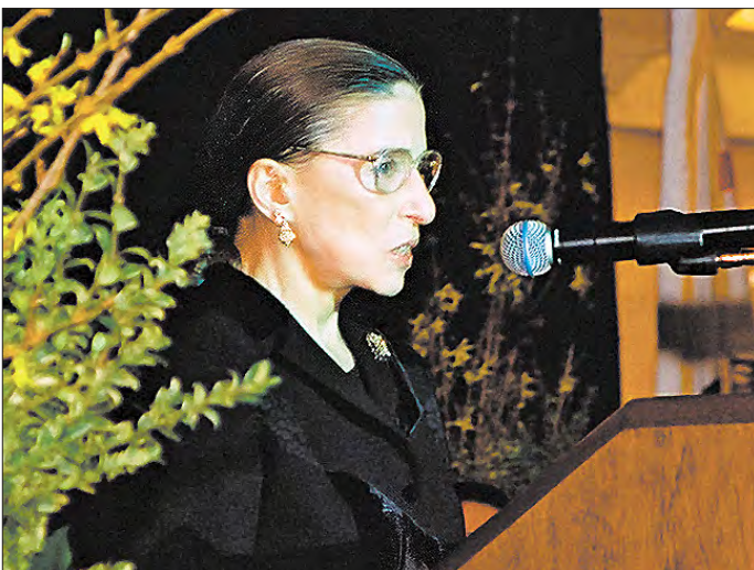
Justice Ruth Bader Ginsburg