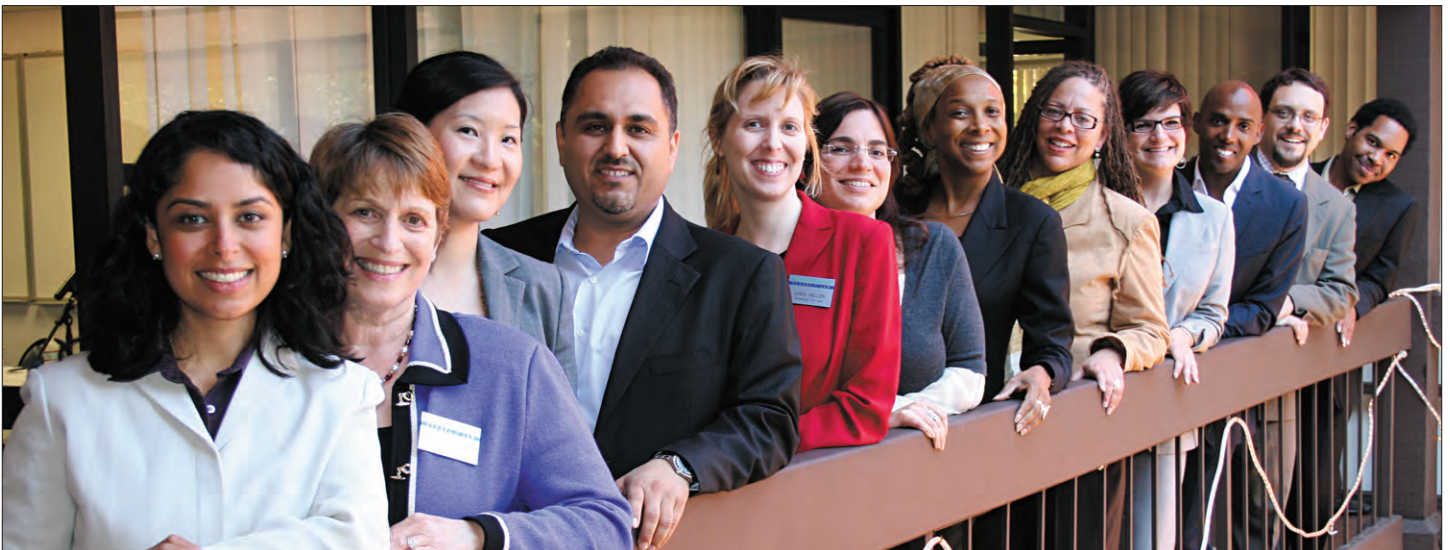
2010 Conference Organizers and Speakers for Women of Color and Intersectionality