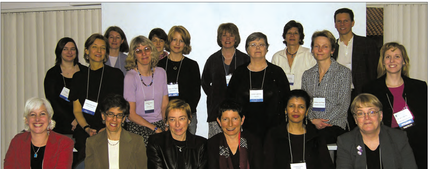
2005 Conference Organizers and Speakers for The Global Impact of Feminist Legal Theory