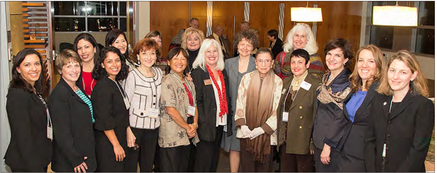
2013 Conference Organizers and Speakers for Her Honor: Women in the Judiciary

For the 2013 Women and the Law Conference, Thomas Jefferson School of Law presented prestigious jurists and distinguished academics discussing Her Honor: Women in the Judiciary . This conference celebrated female judges and examined the importance of women in the judiciary. Speakers discussed the important effect women judges have had on the judicial system and legal regimes. They also examined the special accomplishments of and the challenges facing women