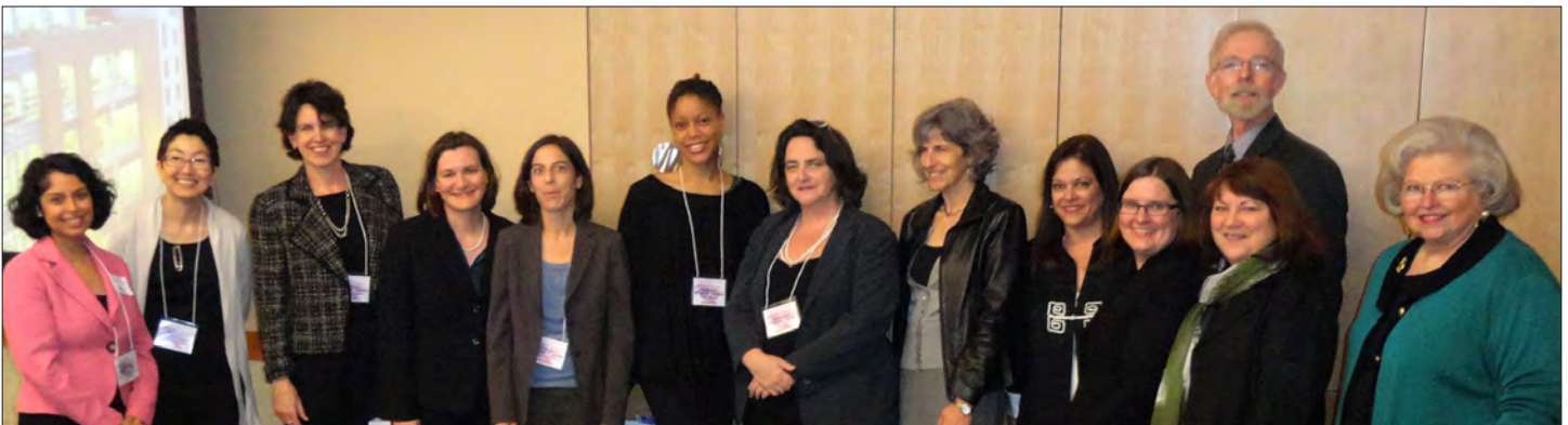
2012 Conference Organizers and Speakers for Reproductive Justice: Examining Choice and Autonomy in the New Millennium