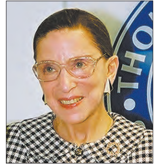
Justice Ruth Bader Ginsburg

address titled, "Workways of the Supreme Court." After this visit, Justice Ginsburg generously created the Thomas Jefferson School of Law Ruth Bader Ginsburg Lecture Series, which at the time was one of only two lecture series bearing her name.