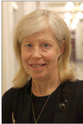
Professor Deborah Rhode