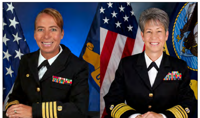
Captain Stacy Pedrozo Ruth Bader Ginsburg Lecturer

The 2014 Women and the Law Conference gathers together a slate of luminaries in military leadership to explore the unique forces shaping women's access to power in the U.S. military. The conference focuses on a number of issues, including whether new statistics on sexual assault in the military warrant legislative changes to the Uniform Code of Military Justice, and explores the topic of women serving in elite combat units.