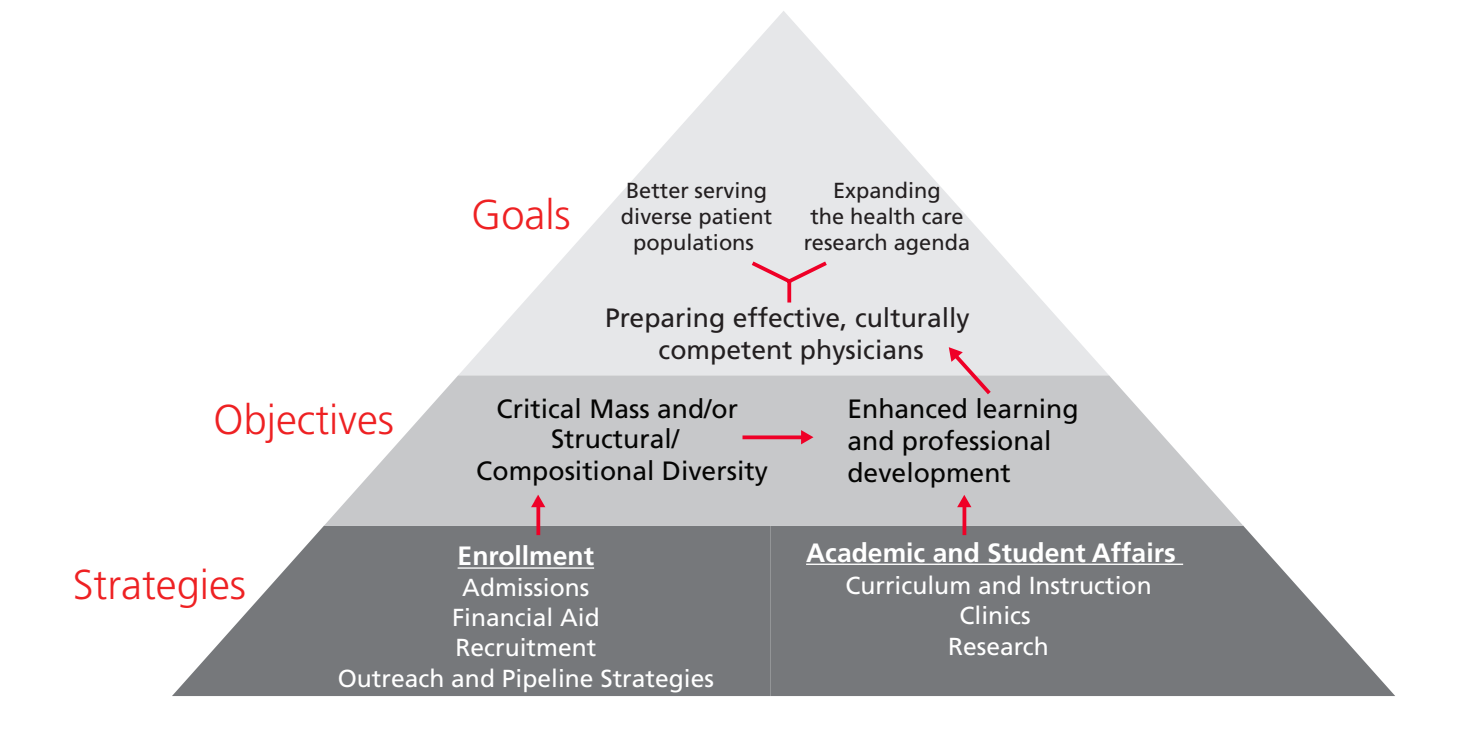
Exhibit 1.3. Diversity Is More Than Race and Ethnicity

The concept of diversity as it is associated with achieving educational goals cannot relate solely to race or ethnicity, nor can it be just about "the numbers." Otherwise, the concept will likely reflect more of an interest in racial balancing—a forbidden focus under prevailing federal case law.