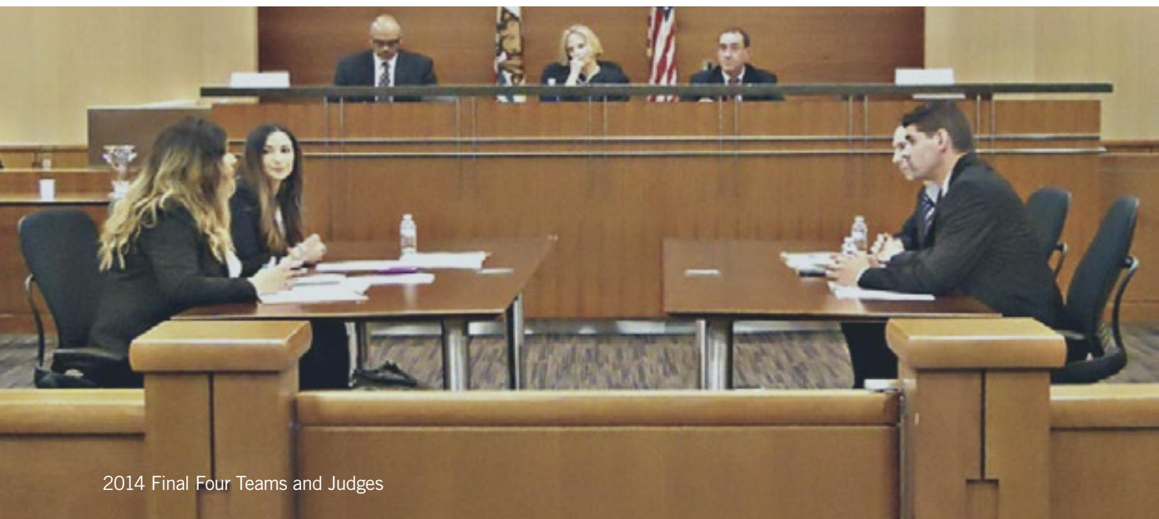
2014 Final Four Teams and Judges

Director, Center for Sports Law & Policy