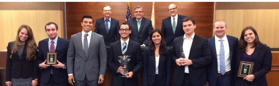
2013 Final Four Teams & Judges

Director, Center for Sports Law & Policy