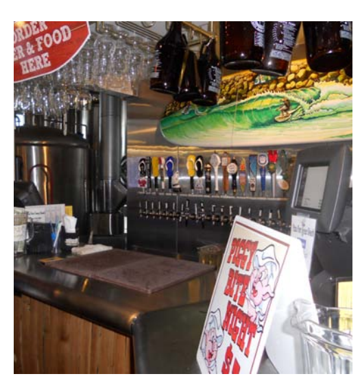
Pizza Port, Ocean Beach.