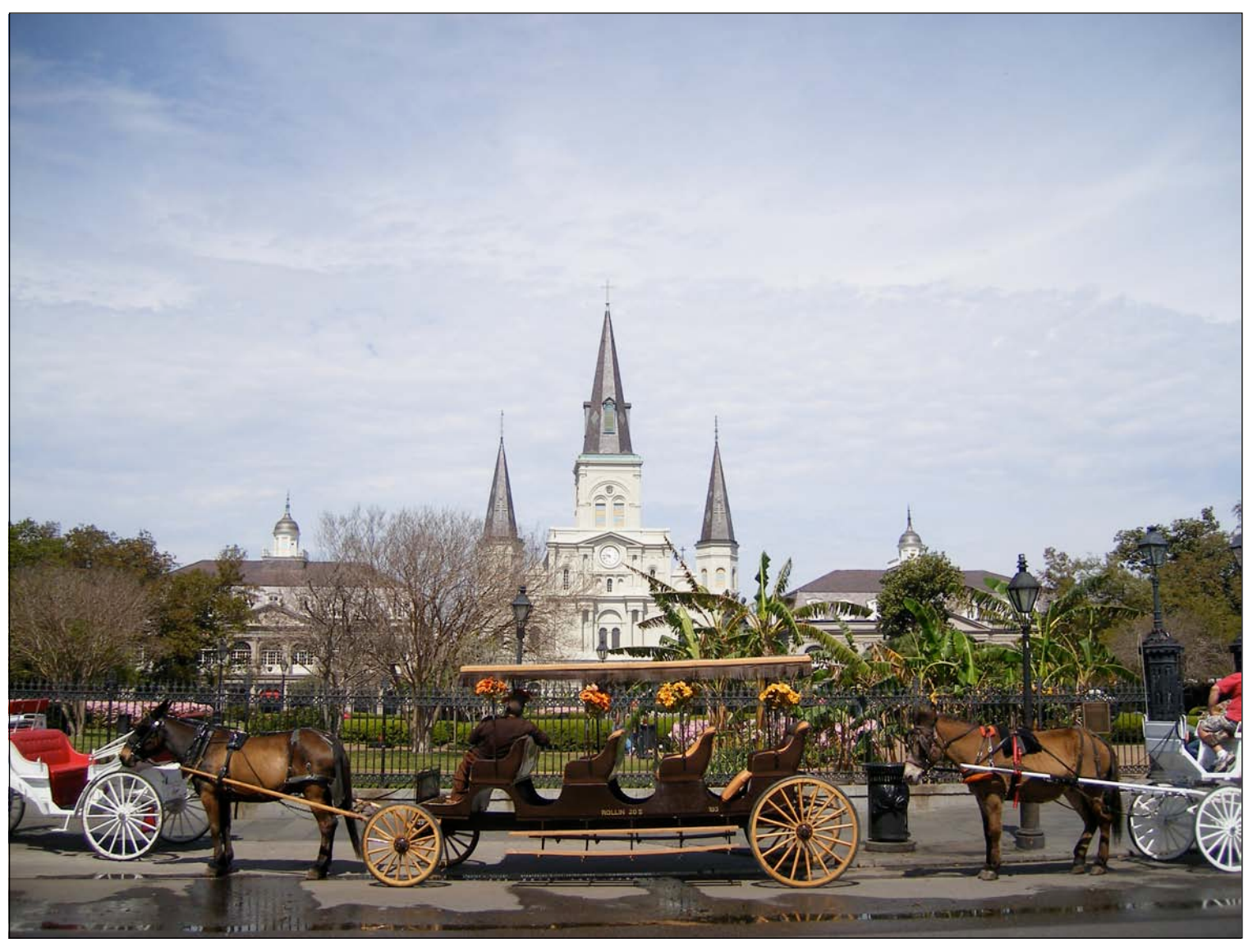
View of Jackson Square and St. Louis Cathedral from Decatur Street, New Orleans, Louisiana | Katie Tooma