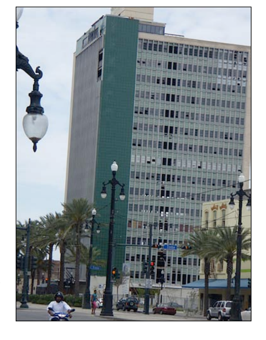
Building on Canal Street, still missing windows in 2009 | Katie Tooma