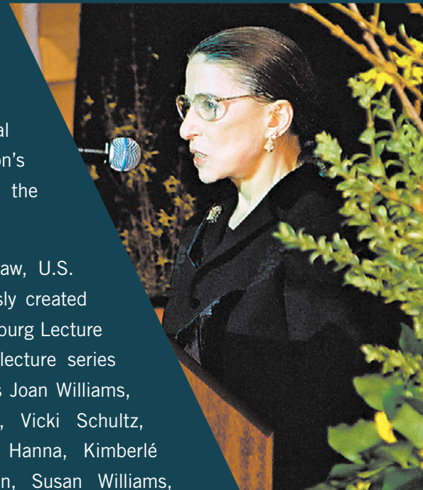
Justice Ruth Bader Ginsberg

Justice Ginsburg returned to the 2013 Women and the Law Conference and discussed the role of women in the judiciary.