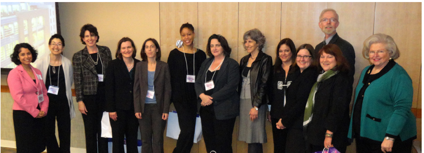
2012 Conference Organizers and Speakers for Reproductive Justice: Examining Choice and Autonomy in the New Millennium