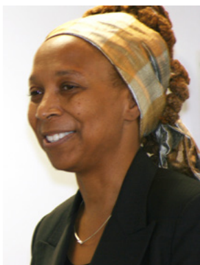
Professor Kimberlé Crenshaw