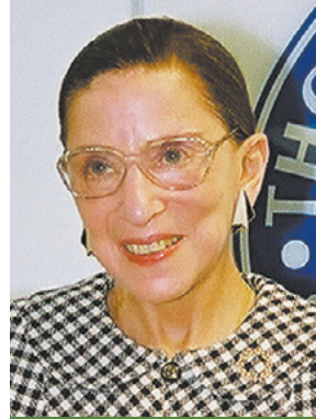
Justice Ruth Bader Ginsburg