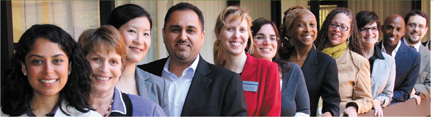
2010 Conference Organizers and Speakers for Women of Color and Intersectionality