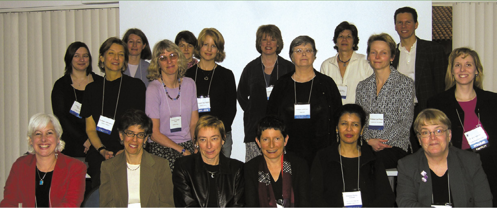
2005 Conference Organizers and Speakers for The Global Impact of Feminist Legal Theory