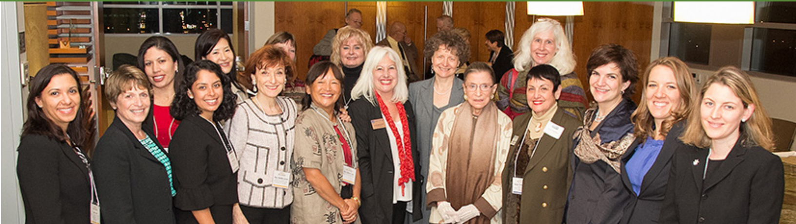
2013 Conference Organizers and Speakers for Her Honor: Women in the Judiciary