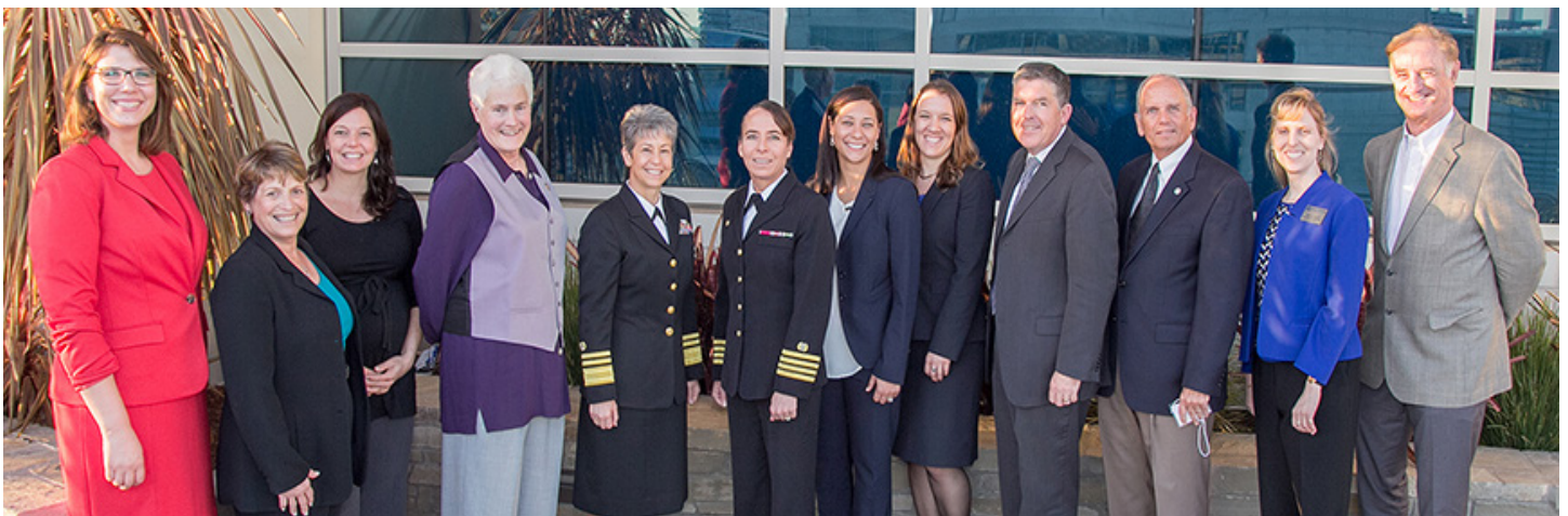
2014 Conference Organizers and Speakers for Women and the Military