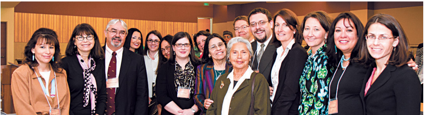
2011 Conference Organizers and Speakers for Gender Justice and Indian Sovereignty: Native American Women and the Law