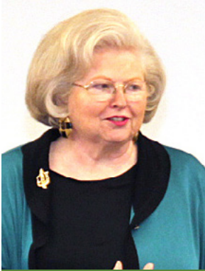
Dr. Sarah Weddington

The 2012 conference, Reproductive Justice: Examining Choice and Autonomy in the New Millennium, was cosponsored by Planned Parenthood of the Pacific Southwest. The conference focused on a broad spectrum of legal, social, scientific and policy issues. Ruth Bader Ginsburg Lecturer Dr. Sarah