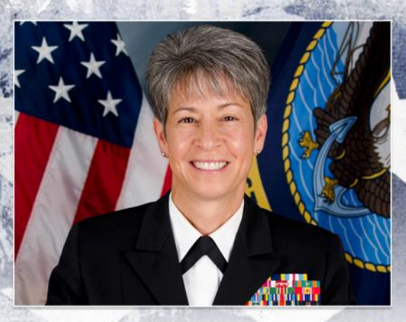
2014 KEYNOTE SPEAKER VICE ADMIRAL NANETTE DERENZI Judge Advocate General, United States Navy

The 2014 Women and the Law Conference gathers together a slate of luminaries in military leadership to explore the unique forces shaping women's access to power in the U.S. military. The conference focuses on a number of issues, including whether new statistics on sexual assault in the military warrant legislative changes to the Uniform Code of Military Justice, and explores the topic of women serving in elite combat units. The conference will be of interest not just to those with a military connection, but to anyone who seeks to gain insight on leadership and success from some of the nation's most powerful lawyers in uniform.