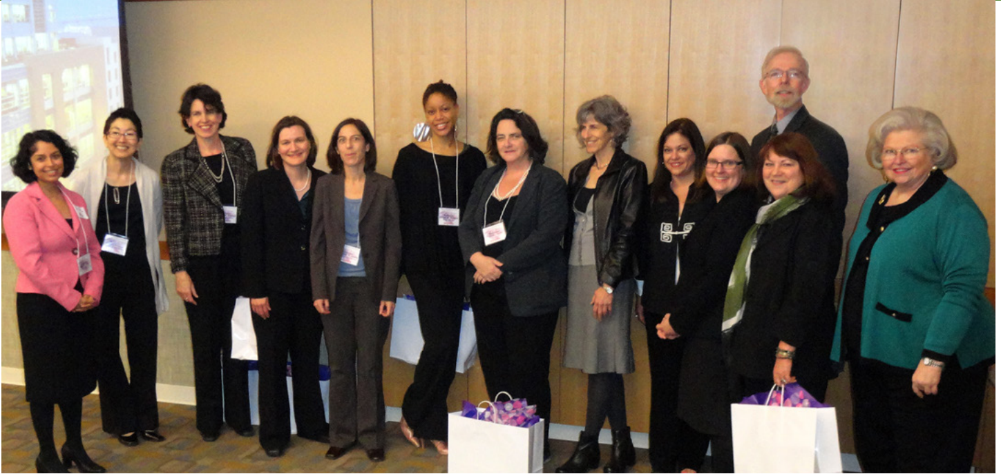
2012 Conference Organizers and Speakers for Reproductive Justice: Examining Choice and Autonomy in the New Millennium