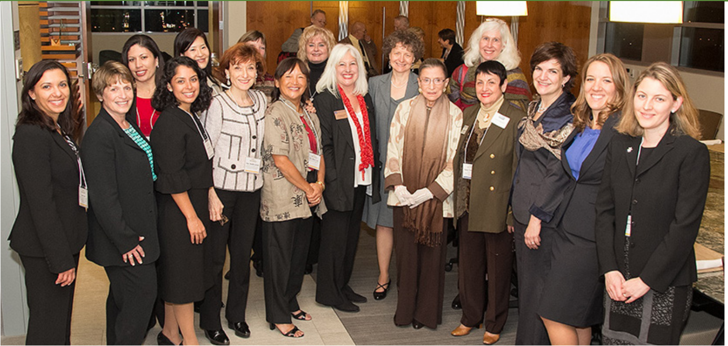
2013 Conference Organizers and Speakers for Her Honor: Women in the Judiciary