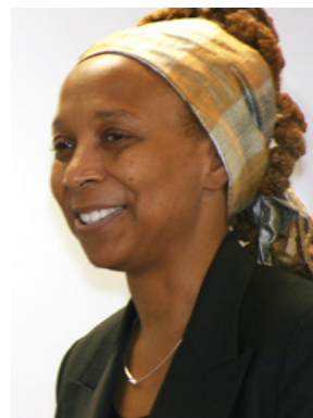
Professor Kimberlé Crenshaw