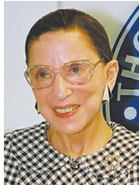
Justice Ruth Bader Ginsburg