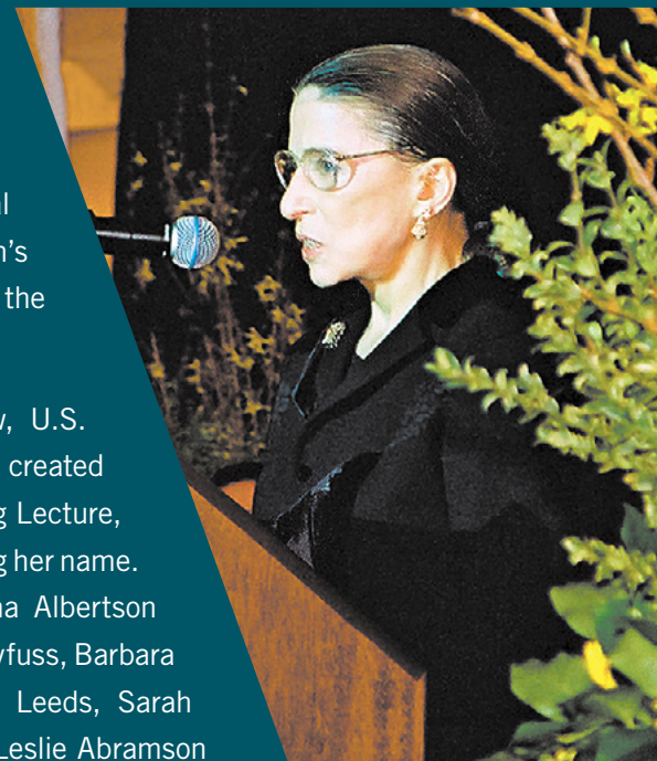
Justice Ruth Bader Ginsberg

The Annual Women and the Law Conference is unique in its early interdisciplinary approach and its commitment to bridging the gap between the teaching academy and the practicing bar.