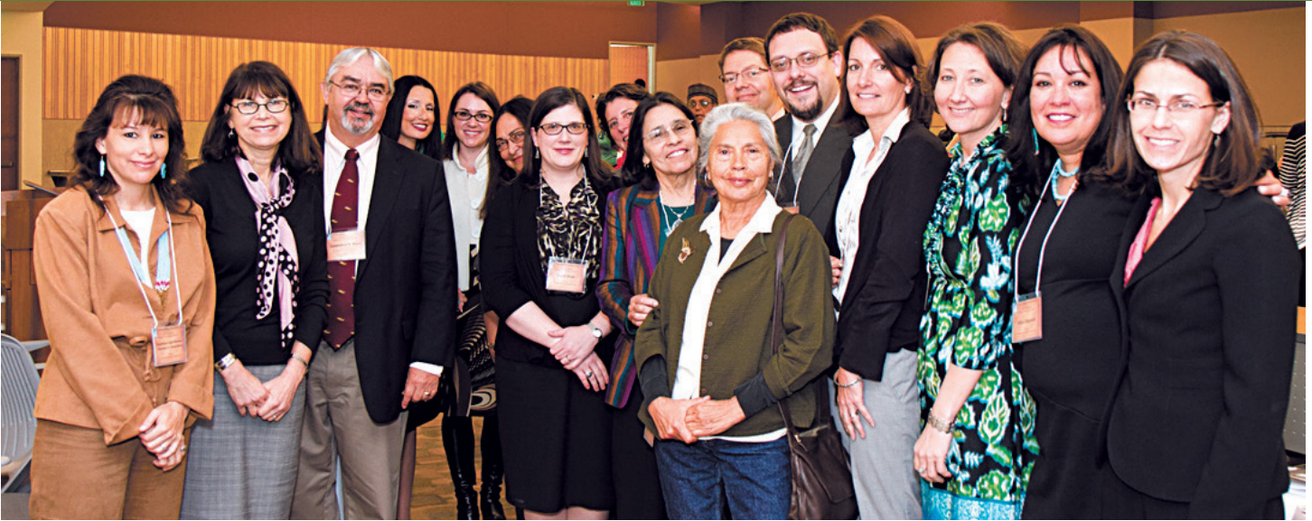
2011 Conference Organizers and Speakers for Gender Justice and Indian Sovereignty: Native American Women and the Law