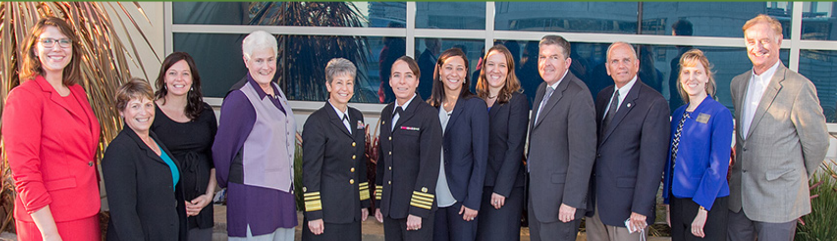
2014 Conference Organizers and Speakers for Women and the Military