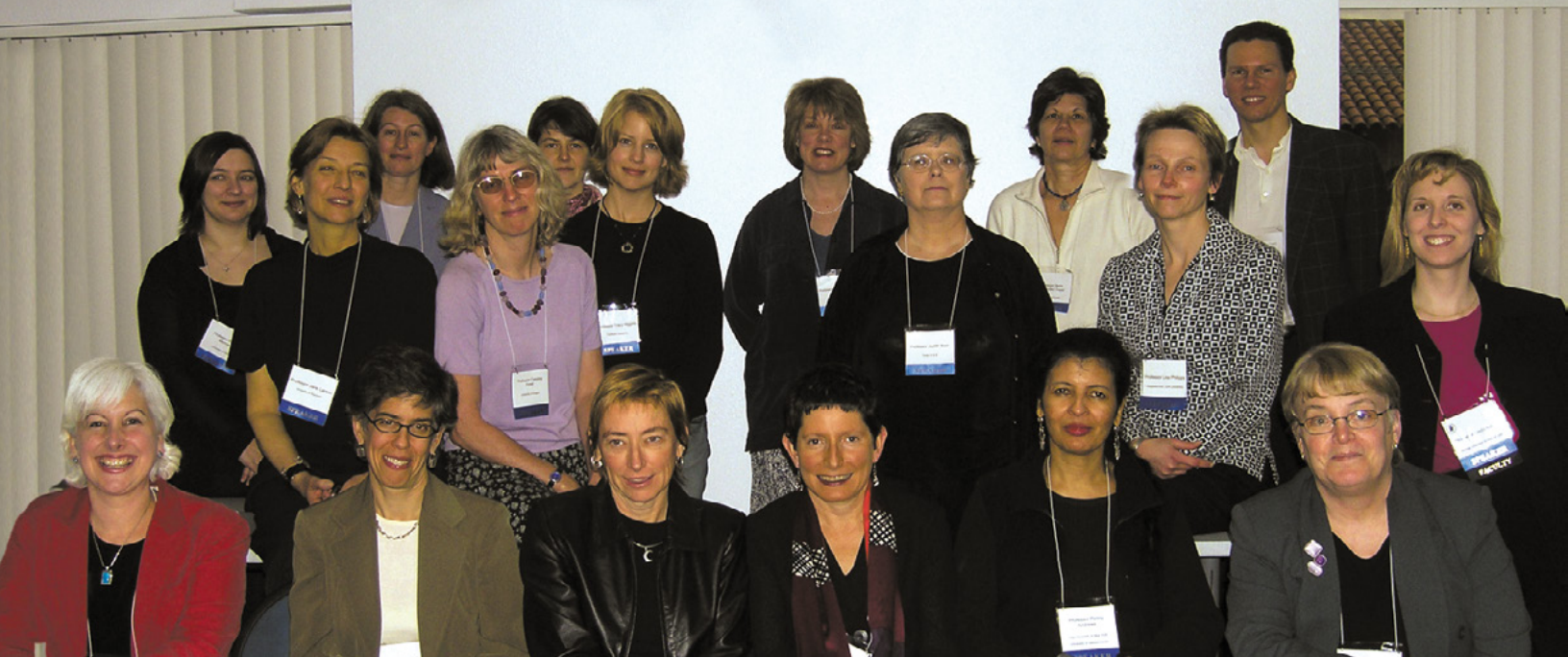
2005 Conference Organizers and Speakers for The Global Impact of Feminist Legal Theory