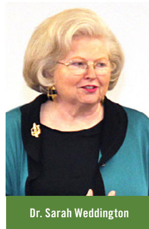
Dr. Sarah Weddington

The 2012 annual conference, Reproductive Justice: Examining Choice & Autonomy in the New Millennium, was generously cosponsored by Planned Parenthood of the Pacific Southwest. The conference focused on a broad spectrum of legal, social, scientific and policy issues. Ruth Bader Ginsburg Lecturer Dr. Sarah Weddington, lead counsel for the plaintiff in Roe v. Wade , fascinated the audience during her talk, “Women Lawyers: The