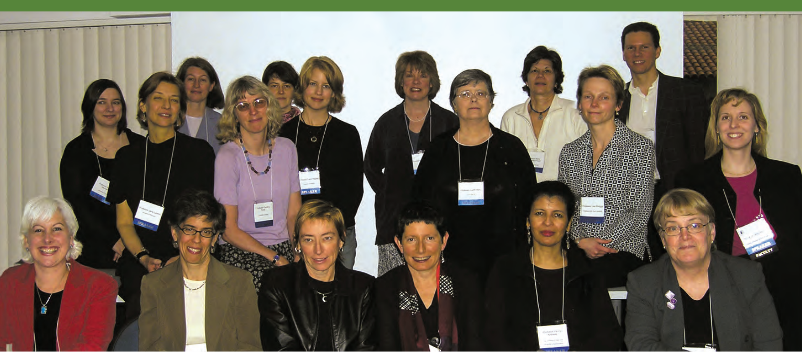
2005 Conference Organizers and Speakers for The Global Impact of Feminist Legal Theory