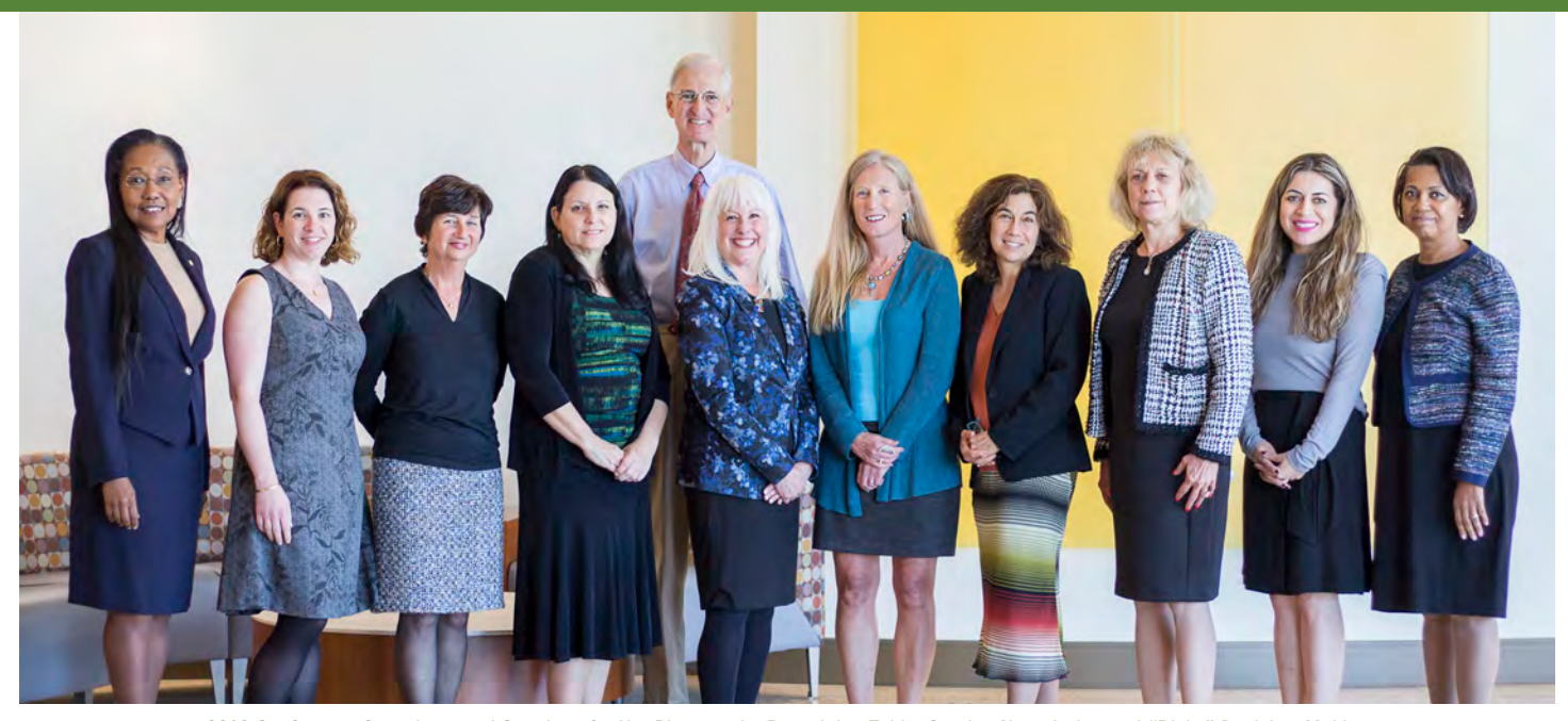
2018 Conference Organizers and Speakers for Her Place at the Bargaining Table: Gender, Negotiation and "Risky" Decision-Making