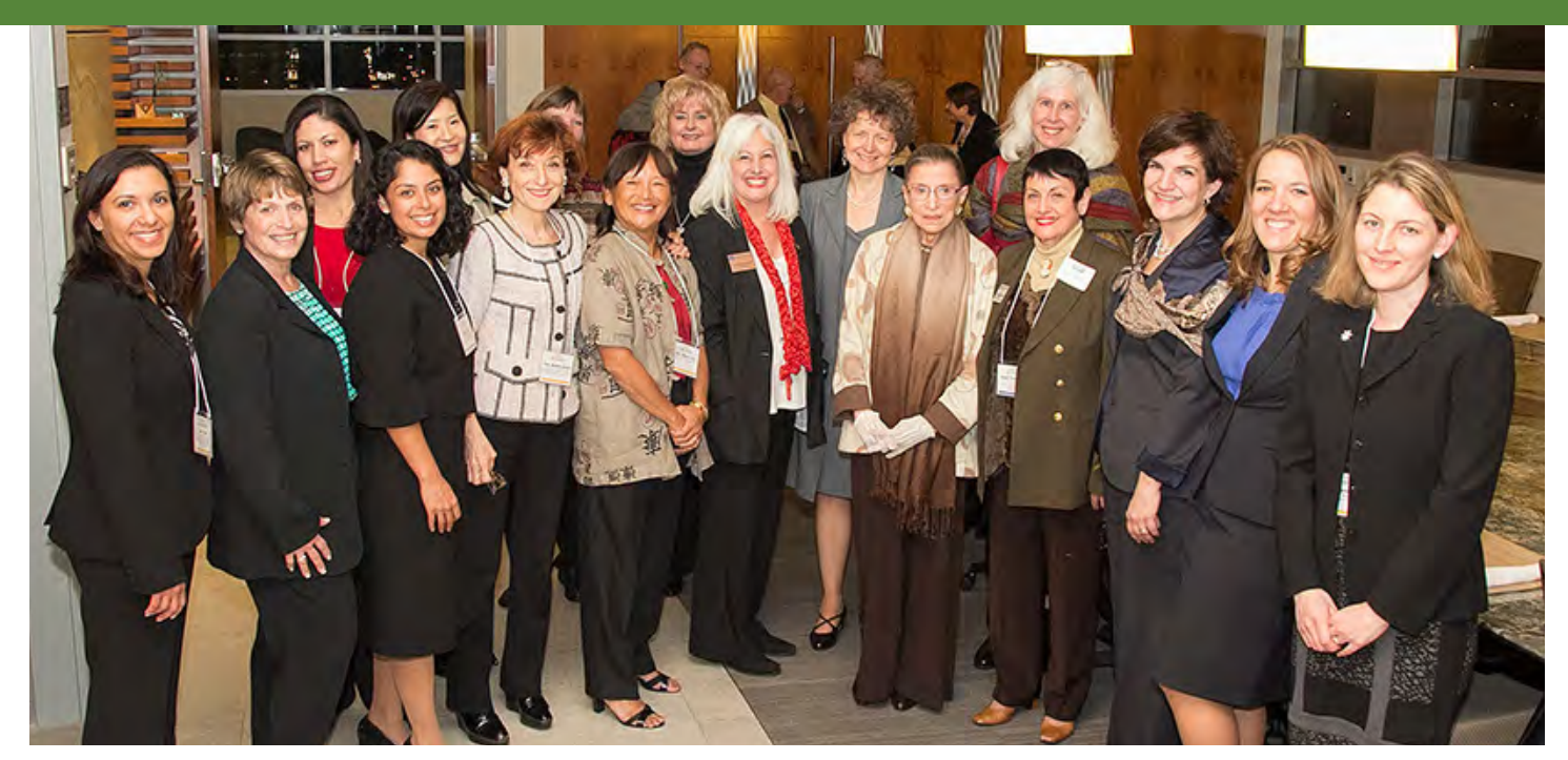
2013 Conference Organizers and Speakers for Her Honor: Women in the Judiciary