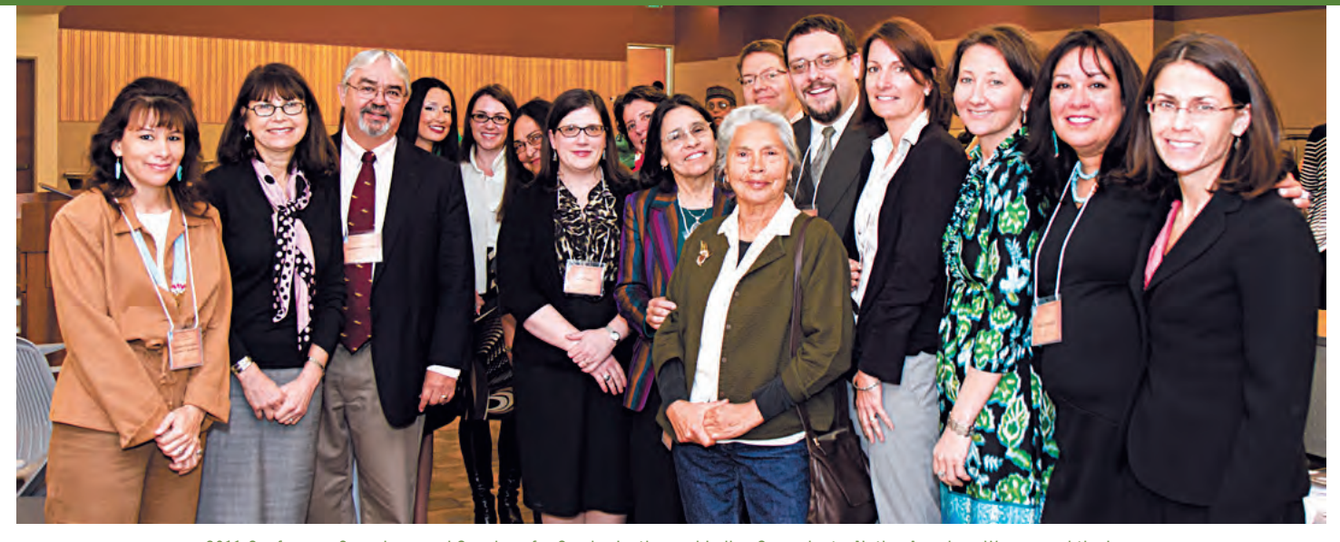
2011 Conference Organizers and Speakers for Gender Justice and Indian Sovereignty: Native American Women and the Law