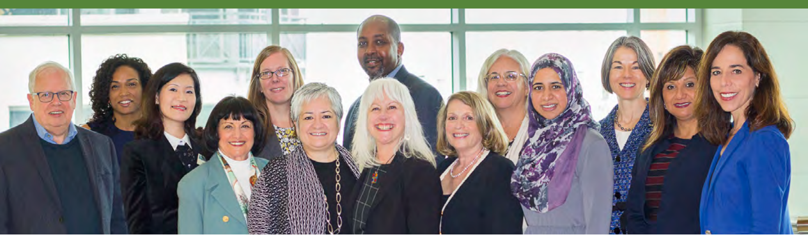
2017 Conference Organizers and Speakers for Pursuing Inclusion: Diversity in the Workplace