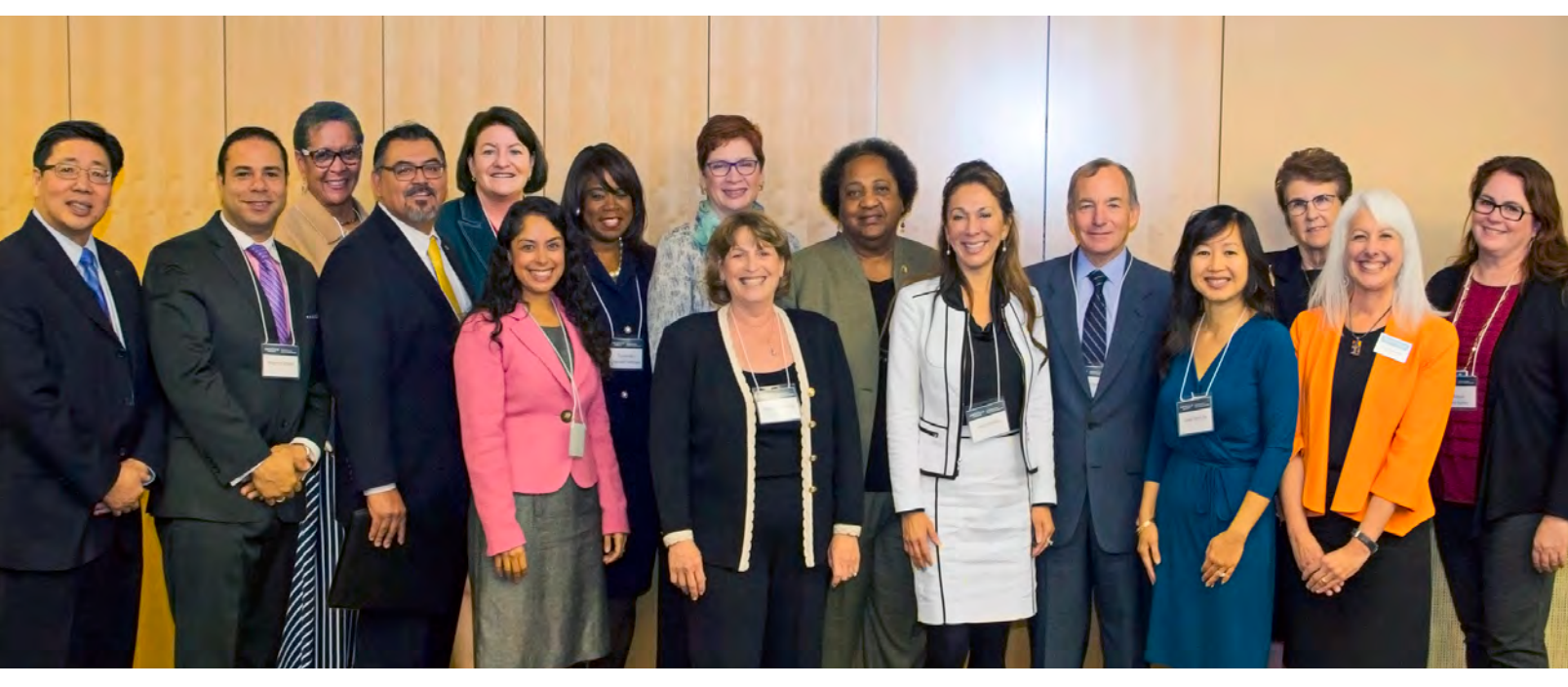
2016 Conference Organizers and Speakers for Pursuing Excellence: Diversity in Higher Education