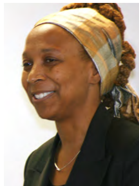
Professor Kimberlé Crenshaw