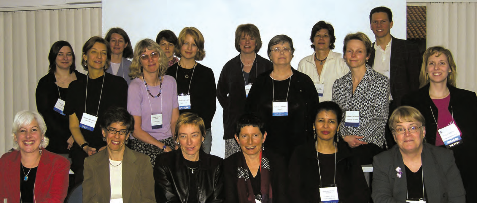
2005 Conference Organizers and Speakers for The Global Impact of Feminist Legal Theory