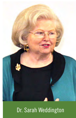
Dr. Sarah Weddington