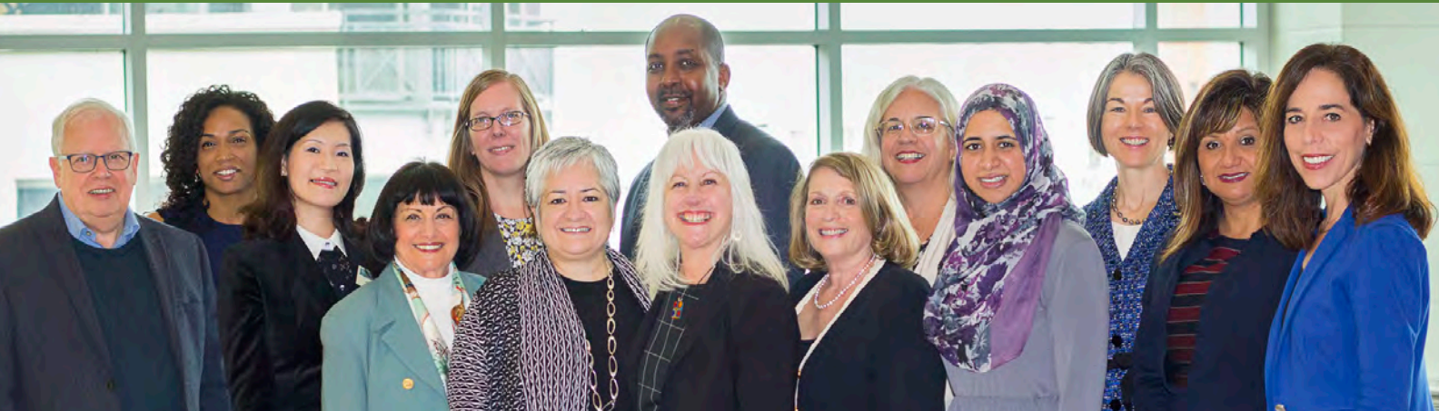
2017 Conference Organizers and Speakers for Pursuing Inclusion: Diversity in the Workplace