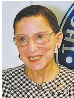
Justice Ruth Bader Ginsburg