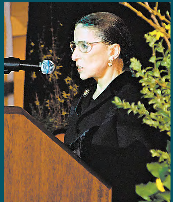
Justice Ruth Bader Ginsburg

The Annual Women and the Law Conference is unique in its early interdisciplinary approach and its commitment to bridging the gap between the teaching academy and the practicing bar.