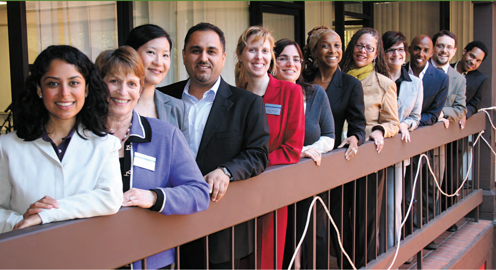
2010 Conference Organizers and Speakers for Women of Color and Intersectionality