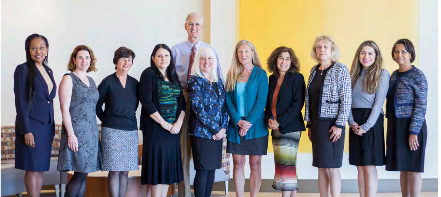
2018 Conference Organizers and Speakers for Her Place at the Bargaining Table: Gender, Negotiation and “Risky” Decision-Making