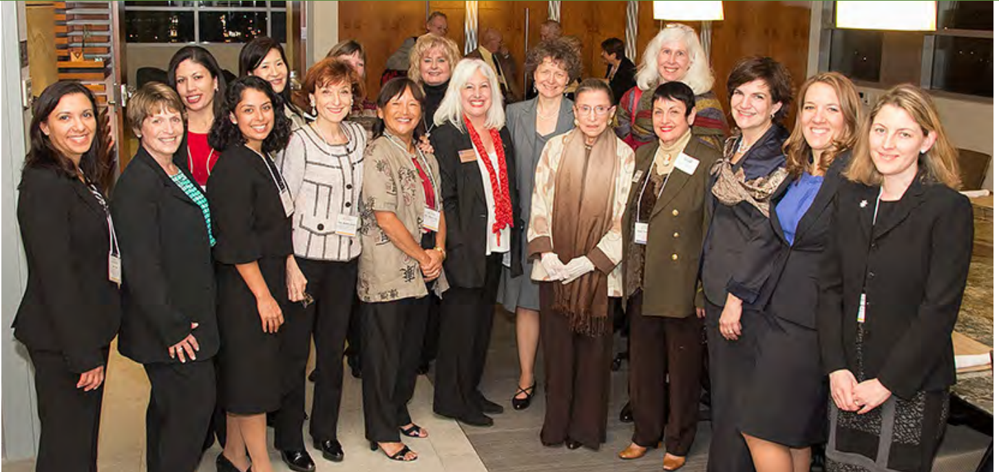
2013 Conference Organizers and Speakers for Her Honor: Women in the Judiciary