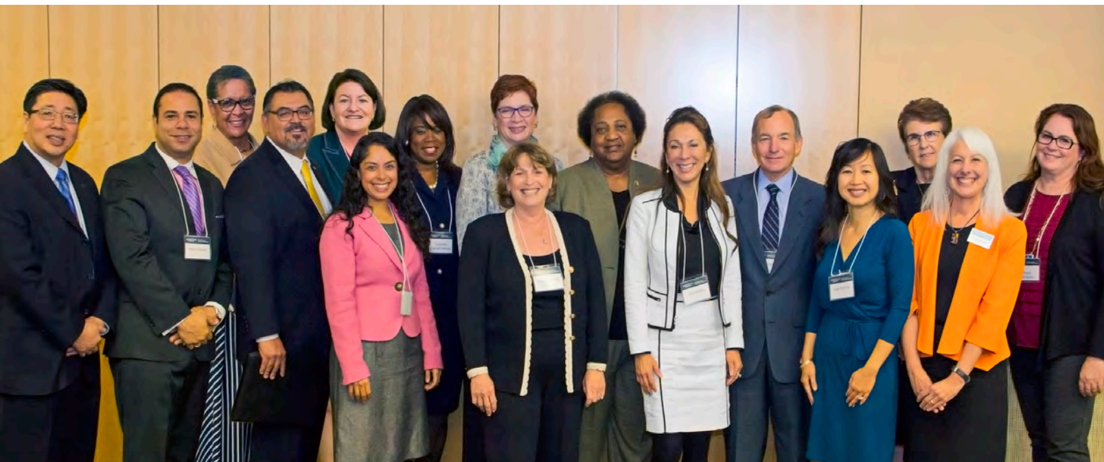
2016 Conference Organizers and Speakers for Pursuing Excellence: Diversity in Higher Education